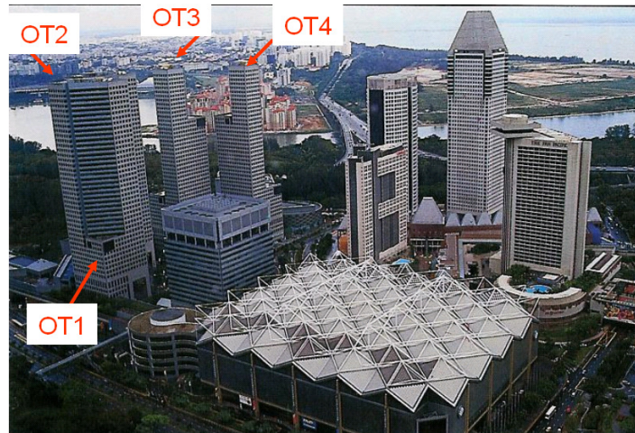
Photo of Suntec City District Area